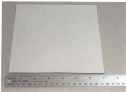
Photo Documentation – The product sample specimen is photographed immediately following specimen preparation and prior to initiating the conditioning period. Typically, the top and bottom faces of the specimen are photographed.