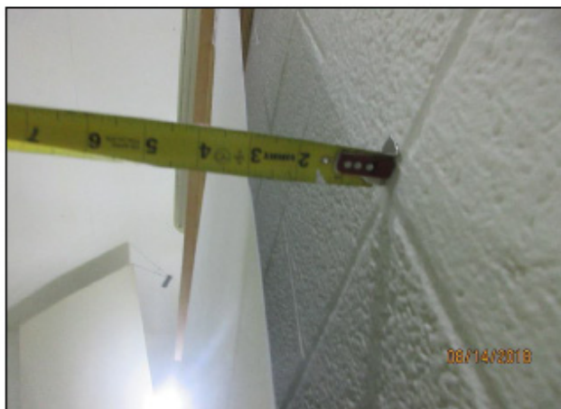
Photo No. 2 Side View of Installed Specimen