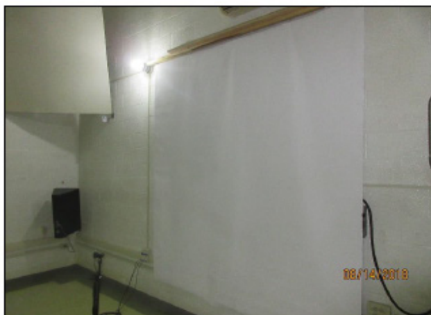
Photo No. 1 View of Installed specimen

Telephone: 717-764-7700 Facsimile: 717-764-4129 www.intertek.com/building